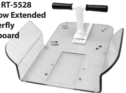
NEW RT-5528 Narrow Extended Butterfly Armboard